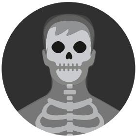
Conventional X-Ray Imaging

These spectral images are transformed into separated bone and soft tissue images by the integrated software. The software contains the material decomposition algorithms needed for dental, dual energy imaging in an easy-to-use format.